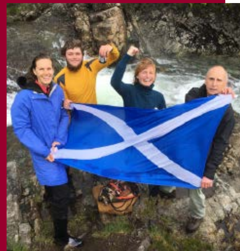
Global Education students visiting Scotland

Trip summary: This program will focus on two tracks: Irish culture or national and international marketing, business and economics. The trip will include informal 'cultural breakfast' presentations, field trips to places of historical interest, combined with visits to business sites, from small craft businesses to multi-national companies. A deeper understanding of the historical, economic, and political issues of Ireland and this region will give context to Irish business