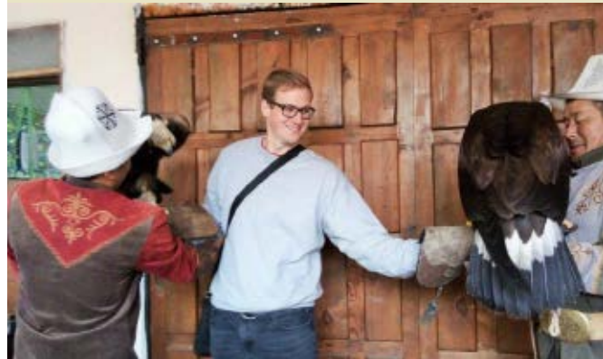
Dry holds two eagles used for falconry