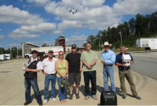
Students in Drone Flight School