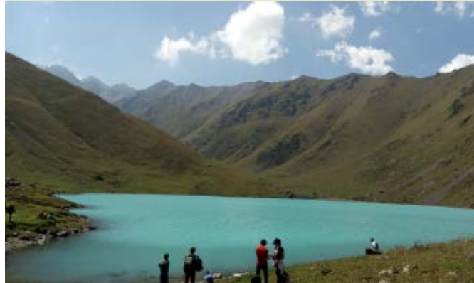
Lake Kol Tor