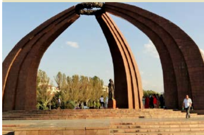
The Monument of Victory commemorates those who died in WWII and features a woman standing over an eternal flame