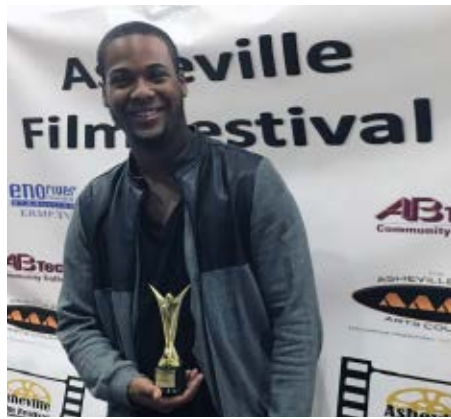
ASHEVILLE FILM FESTIVAL, PAGE 11