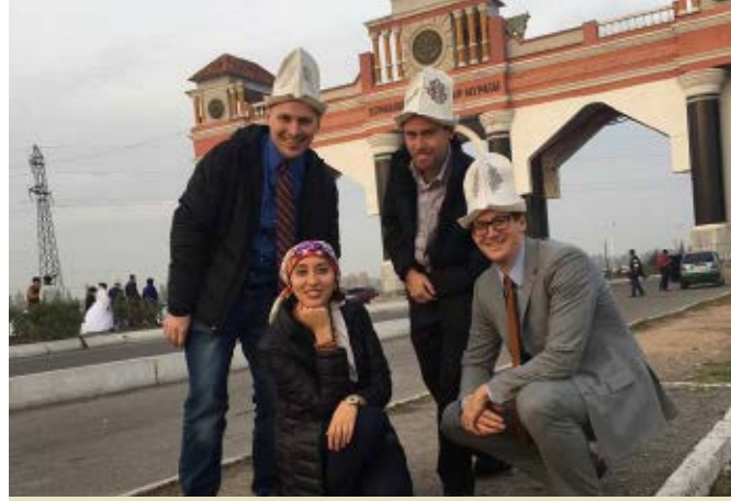
Dry attends a traditional Kyrgyz wedding with friends

Finally, there are a number of historical sites that document the history of the region, including petroglyphs and the Burana Tower, which was part of an 11th century Silk Road city.