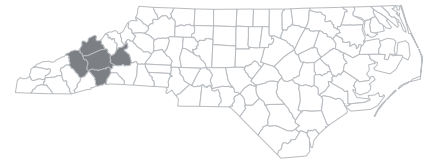
THE WESTERN GATEWAY, NC

The Nursing program 1 was established in 1970. In FY 2019-20, A-B Tech enrolled 261 students in the program. Of these students, 123 graduated with an associate degree in FY 2019-20.