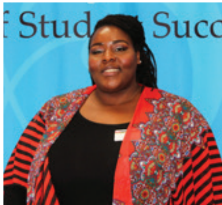
MINORITY STUDENT SUCCESS, PAGE 4