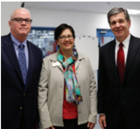
GOV. ROY COOPER, PAGE 8