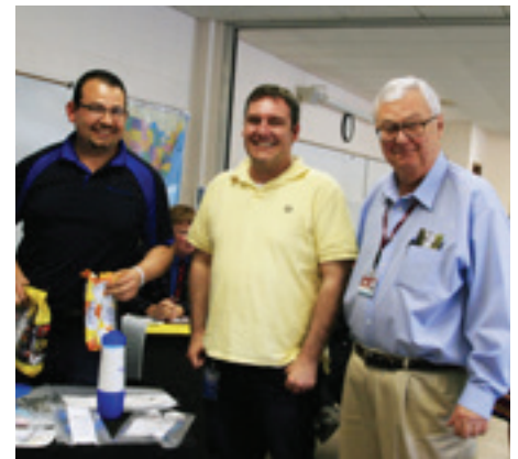
MADISON CAREER CENTER, PAGE 11