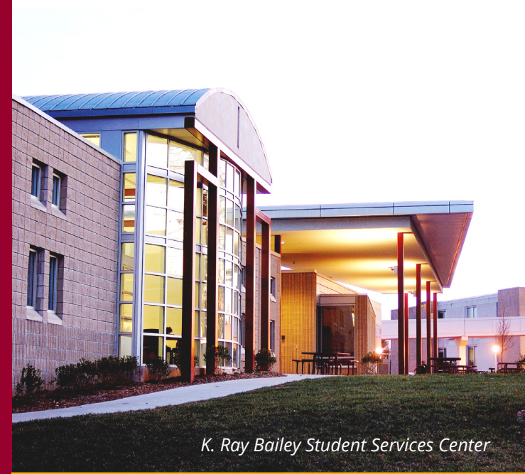
K. Ray Bailey Student Services Center

Our Student Support Services are provided by skilled professionals committed to your success.