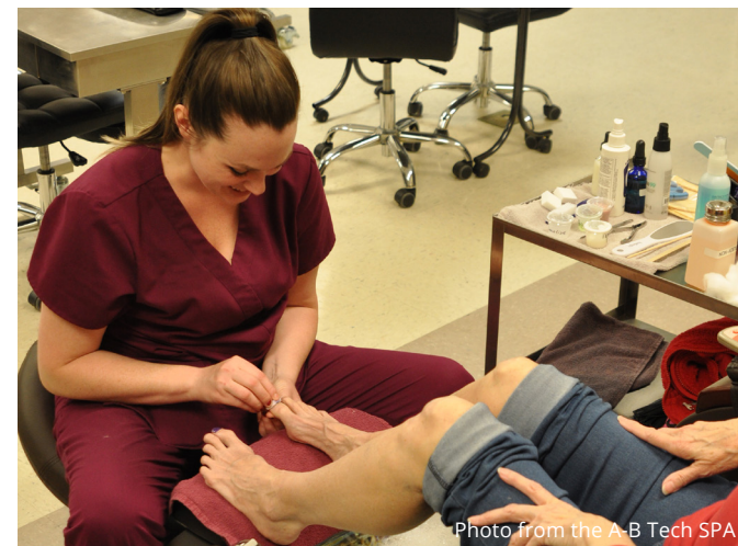
Photo from the A-B Tech SPA