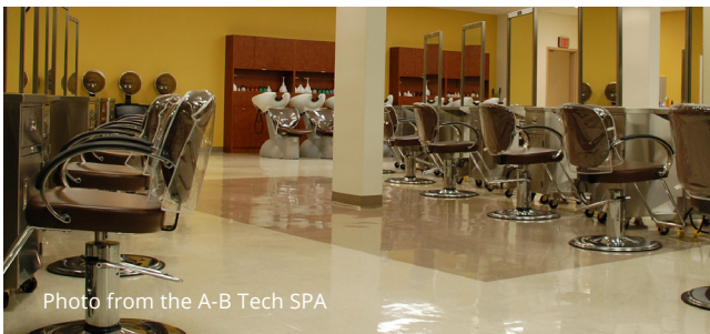
Photo from the A-B Tech SPA

Please note: Client must provide hair extensions