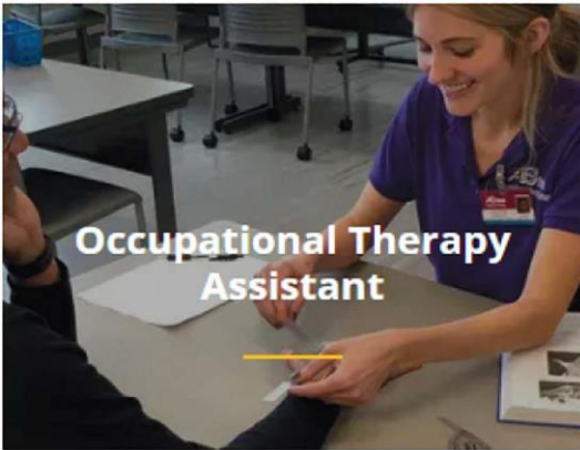
Occupational Therapy Assistant