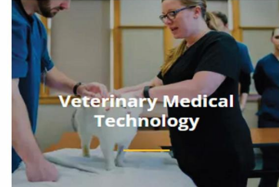
Veterinary Medical Technology