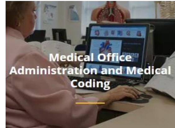
Medical Office Administration and Medical Coding