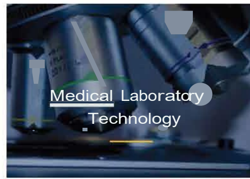
Medical Laboratory Technology