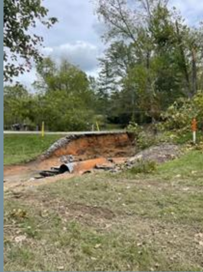
Road to leave my house day after Helene

The morning of September 29th, 2024, I had to flee my house due to flooding and did not return until June of 2025. I was lucky to have neighbors unaffected, and to have never been truly homeless. For many in Asheville, a return to normalcy hasn't happened or never will. Learning about homelessness and the causes connect to me so deeply because I watched my community experience it.