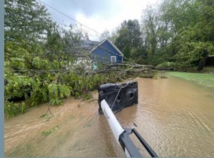
My house morning of Helene once it was safe to go out