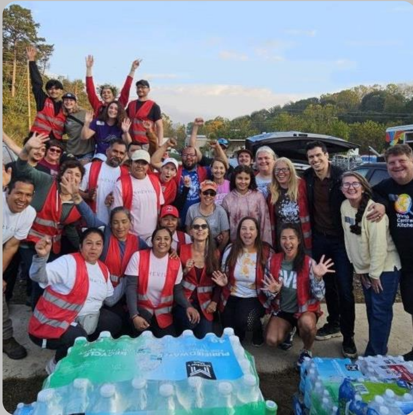
A group of volunteers who delivered water bottles during the hurricane helene relief. https://www.belovedasheville.com/our-work/street-pantries/